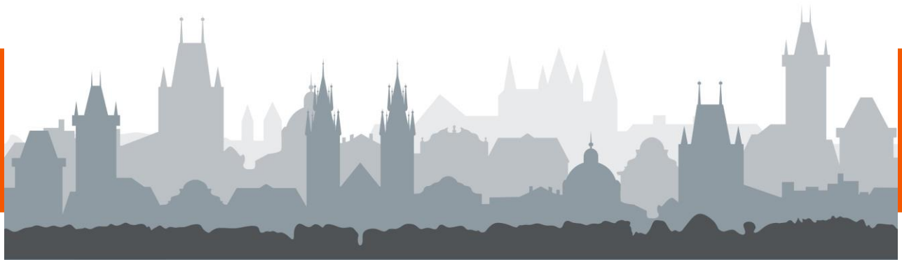
City of Prague